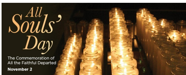
"The souls of the righteous are in the hand of God." - Wisdom 3:1