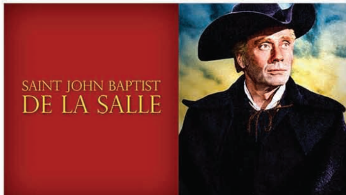
SAINT JOHN BAPTIST DE LA SALLE

The inspiring story of a 17th century French priest who became the Founder of the Brothers of the Christian Schools, an order known today as the De La Salle Christian Brothers. From a wealthy upper-class family, he gave up everything to serve the needs of educating poor children, facing tremendous opposition along the way.