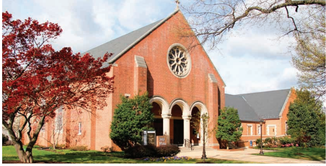
3810 Massachusetts Ave NW

MAILING/OFFICE ADDRESS 3125 39TH ST NW WASHINGTON DC 20016 PHONE 202-362-3323 FAX 202-237-0652 www.annunciationdc.org