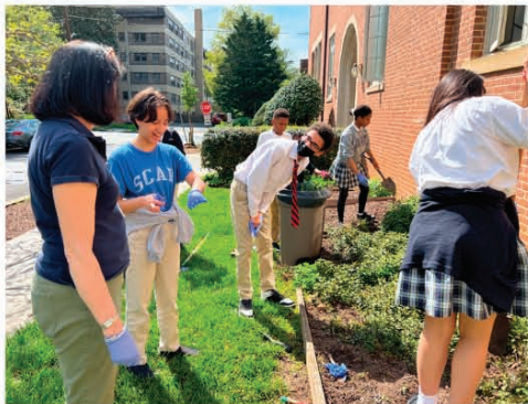
Thank you ACS Environmental Club for helping to take care of our community.