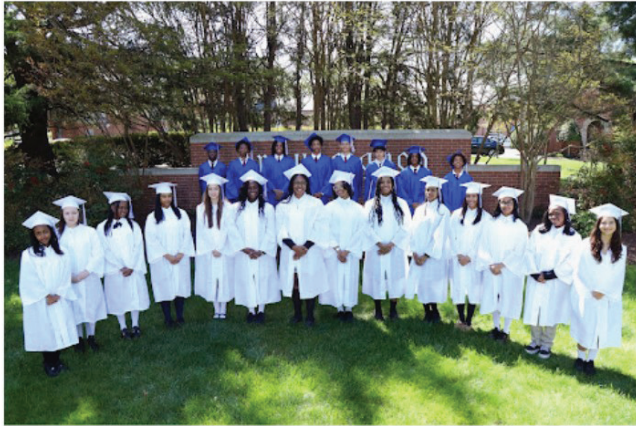
ANNUNCIATION CATHOLIC SCHOOL 8TH GRADE CLASS 2023-2024

Join Us As We Honor Our 8th Grade Graduating Class of 2024